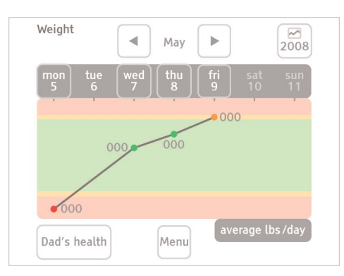
Figure 3. Trends graphs allow users to track health over time and reflect on patterns in their day-to-day life.

Trends graphs will allow users to track mood and physiological health over time (Fig. 3).