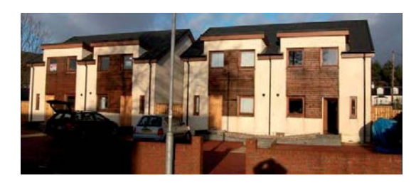
Figure 1: Front elevation - Queen Street, Dunoon.

The Enkelt Simple Living project consists of four Scandinavian inspired semi-detached low energy houses. Each is two stories with three bedrooms. They are constructed on a brown-field site at Queen Street, Dunoon, Scotland. The following sections discuss the strengths and challenges to achieving low carbon targets experienced in the project.